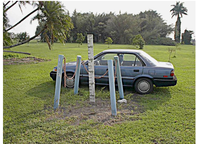
Fig. 3. Subsidence of soil in Florida due to oxidation of organic matter following drainage. When the post was installed in 1923, with its base on bedrock, its top was level with the soil surface.

exchange measurements of respiration on drained organic soils in the Sacramento Delta in California where similar subsidence has occurred (Deverell and Rojstaczer, 1996). In the cooler climates of the midwestern United States the loss rate has doubtless been slower, but the sheer quantities of drained cropland (more than 16 M ha in OH, IN, IL, IA and MN; USDA, 1987) and the long time interval since drainage commenced suggest that drainage may have been a major factor in the frequently cited loss of 30–50% of pre-cultivation SOC across the region.