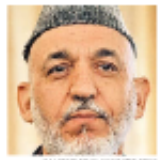
President Hamid Karzai