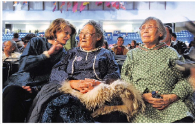
Not on the Alaska ballot, but still a contender: Senator Lisa Murkowski of Alaska, left, is hoping to become the first write-in candidate to win a Senate race since 1954. Page A18.