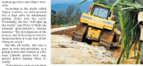
In Takei, Papua New Guinea, a man salvaged a tree that had been felled for road construction.

TAKEI, Papua New Guinea — A booming myth in the Southern Highlands of Papua New Guinea is said to have heralded the arrival of ExxonMobil, the American oil giant that is preparing to extract natural gas here and ship it overseas.