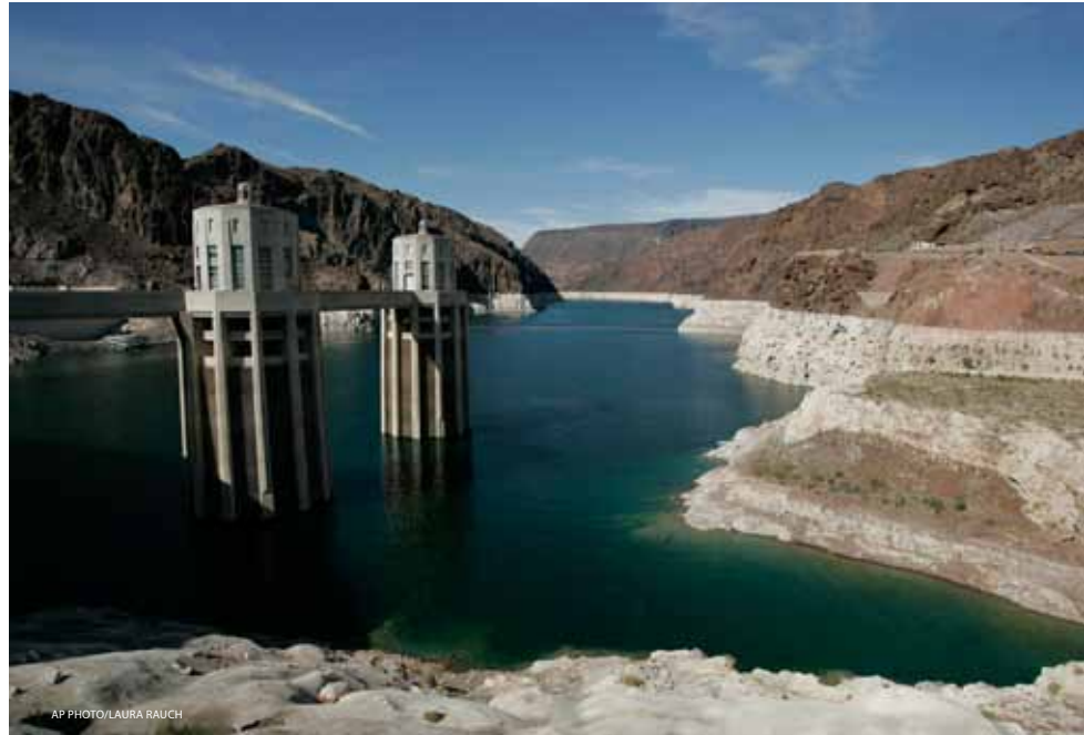
The reduction in water levels due to drought on Lake Mead can be seen by the white ring around the shore at the Hoover Dam in Boulder City, Nevada.

According to Headwaters Economics, “ fighting wildfires costs U.S taxpayers $3 billion annually , more than twice what it cost them two decades ago.”