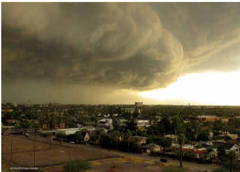
Storm clouds carrying heavy rain move across downtown Phoenix in October 2010. A series of powerful thunderstorms hit the area with high winds, hail and, heavy rain.

December 2010 delivered an unusually wet Christmas to southern Californians in the form of a weeklong rainstorm that caused severe flooding. These raging waters washed away highways and homes throughout the greater Los Angeles area. Flooding of this magnitude spreads urban environmental toxics and increases the risk of waterborne diseases , and in 2010 caused nearly $3.9 billion of property damage.