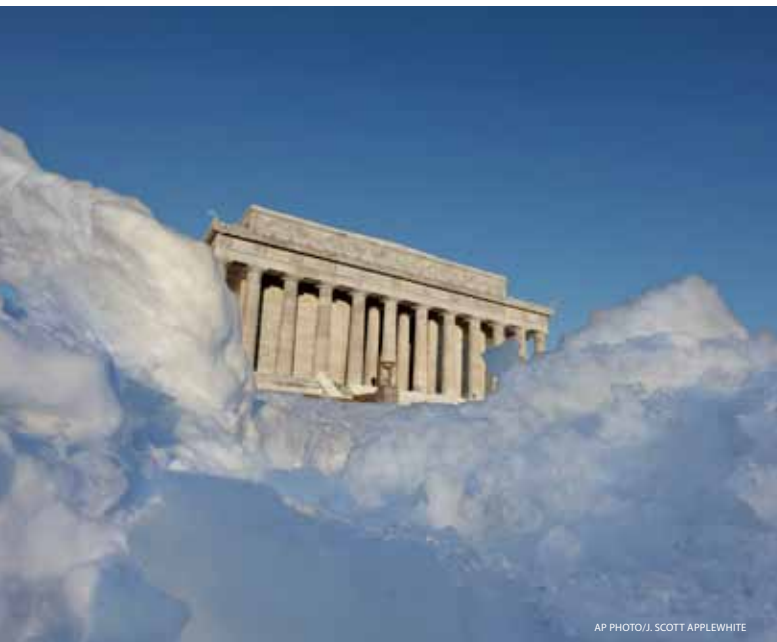
After a week of record-breaking snowfall, snow is piled in front of the Lincoln Memorial in Washington in February 2010.

More than $320 million in federal aid money has been provided to help Tennessee victims rebuild their lives but many people sustained heavy losses that cannot be covered by public money or insurance. According to the National Climatic Data Center , 20 people were killed. It also left thousands of people homeless. This was from a storm system that climate scientists believe will become the norm in a warming climate . See photos of the flood damage here .